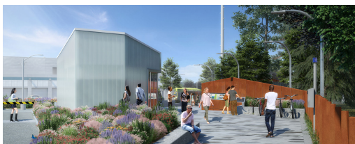
A conceptual rendering of the SUP terminus in Tarrytown.