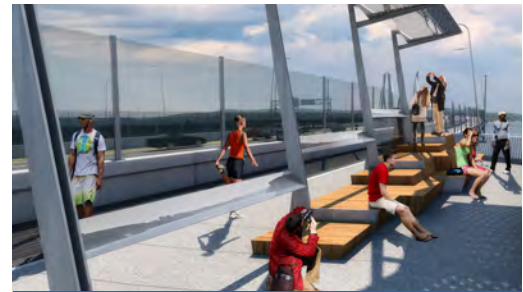
The Tides of Tarrytown belvedere captures views of the river to the north as well as the New York City skyline to the south.