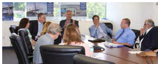
VQP members review options for the bridge's SUP landings.