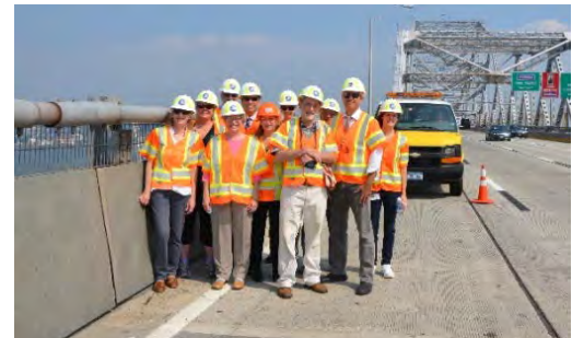
VQP members tour the existing bridge to get a firsthand experience of views, walking distances, noise, wind, and other environmental factors affecting the SUP and belvederes.