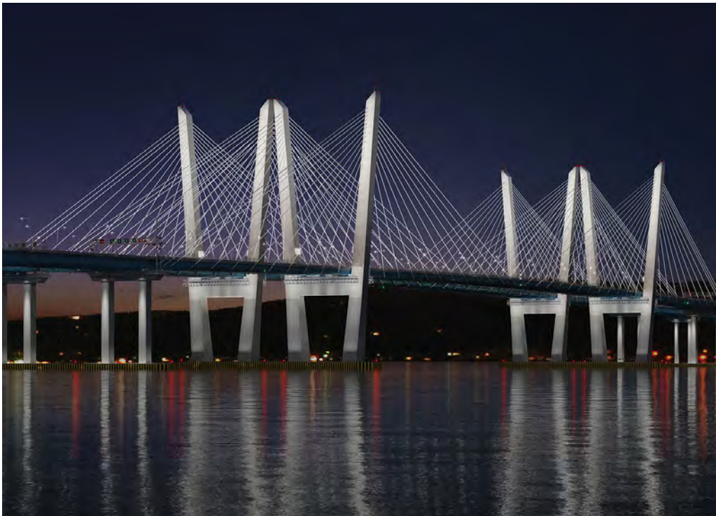
Based on public input, the VQP chose chamfered-top towers for the New NY Bridge. Above Image: Rendering of new chamfered-top towers.

To get more information about the VQP, visit NewNYBridge.com/VQP