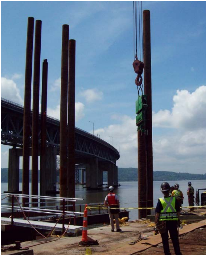
Installation of the Westchester County temporary trestle.

The Rockland County trestle, accessible by land, will support new construction of the westernmost 1,000 feet of the new bridge. Following completion of the bridge, a portion of the Rockland County trestle will remain as a maintenance dock.