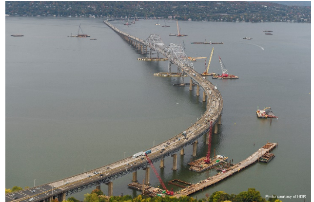
The Westchester County temporary trestle reduces the need for dredging, a benefit to river ecology.

The platforms will decrease the need for dredging, benefiting river ecology and reducing crane and barge traffic. The work platforms will also allow crews to work offshore. The trestles are built to support 250-ton cranes and other construction equipment, and will reduce the need to have large trucks passing through surrounding residential areas.