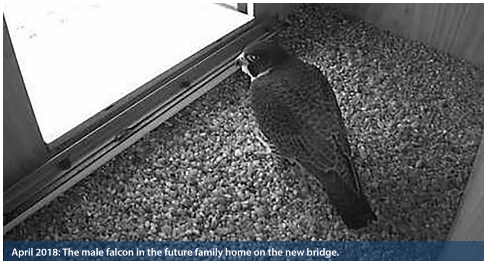
April 2018: The male falcon in the future family home on the new bridge.

More than 400 feet above the Hudson River, a nest box installed in the iconic tower of the Governor Mario M. Cuomo Bridge will serve as the future seasonal home for the fastest member of the animal kingdom: peregrine falcons.