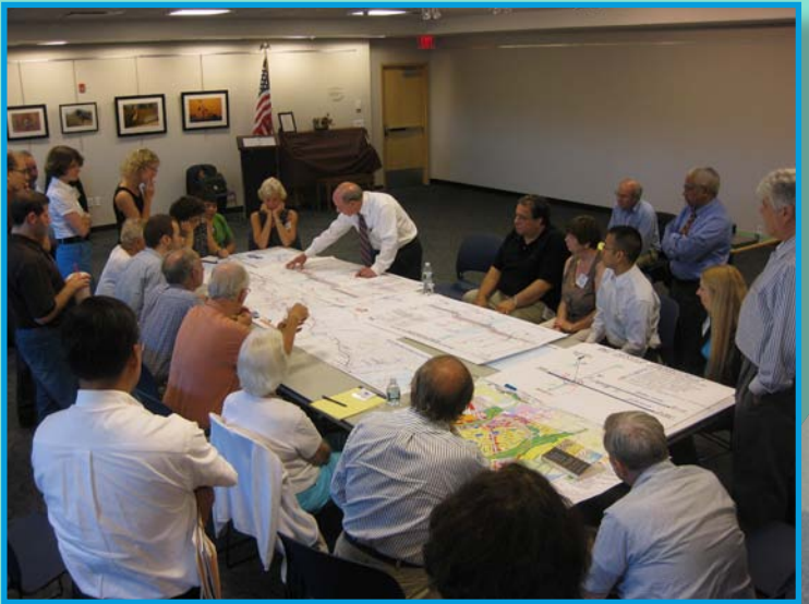
Above Photos: Members of the public involve themselves in the planning process at SAWG (Stakeholders' Advisory Working Group) meetings.