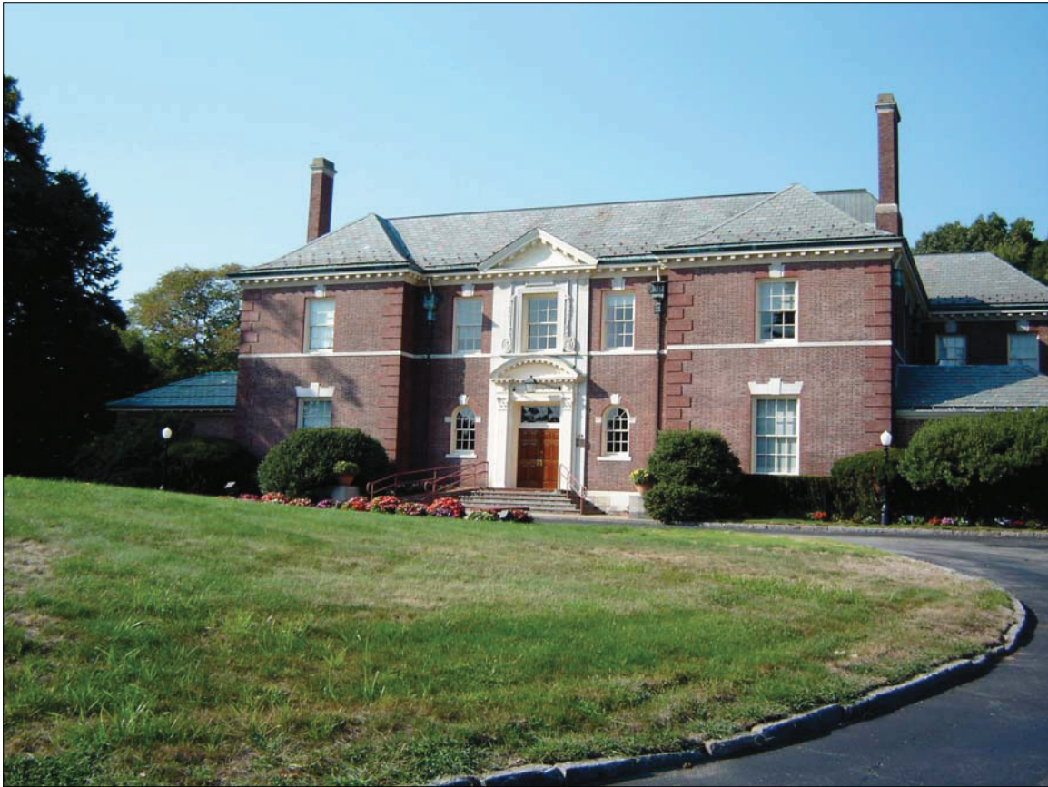
Photo 1. Looking toward main, or south façade of 99 White Plains Road, which is set back from road. Note projecting bays accented by brick quoins and full-height, recessed entry bay set within stone surround. Other details include original fenestration, accented by keystones; denticulated cornice; and slate roof.