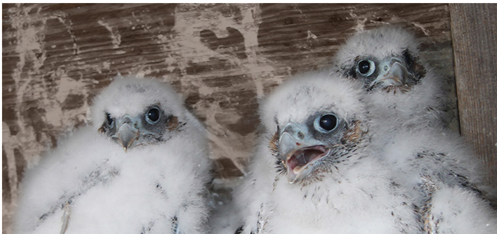
Hudson, Bridge-ette and Zee hatched in the Tappan Zee nest box in April 2015. Their names were suggested by local students from Rockland and Westchester counties.

Hundreds of feet above the Hudson River, a nest box installed in the steel superstructure of the Tappan Zee Bridge provides a seasonal home for the fastest member of the animal kingdom: peregrine falcons.